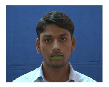
Fig. 3. Frame with lip contour by RCF energy method.