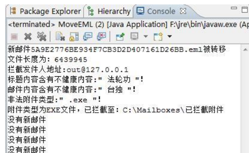
Fig. 2. Exe attachment containing the virus blocked the results.

In order to test the method proposed by this article, we use Chinese spam corpus collected (CSpam) [9] from CAS institute of Computing for experiments. Test data includes test content, the number of tests, and accuracy, which is shown in Table I.