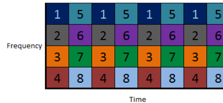
Fig. 3. FDM with TDM.

In Fig. 1, we show the current multiplexing of cell phone operators. There are four users who are able to make phone calls (Users 1 to 4). Besides, there are four more users who are hearing the operator busy tone (Users 5 to 8). There is only one way for any of the waiting users to establish a connection. That is, at least one of the four communicating users ends their phone call. Fig. 2 represents TDM where users have a time limit. When we use TDM, within the same period, all users are able to communicate with each other. Fig. 3 shows our system, which uses both multiplexing techniques, and also a queuing algorithm. Within the same period, all the users are able to communicate four times.