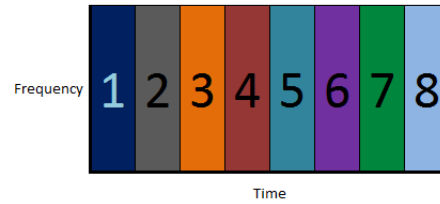
Fig. 2. TDM.